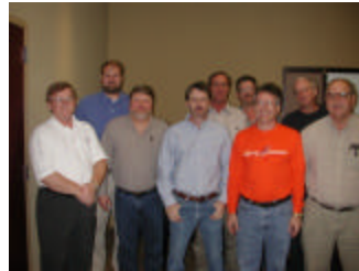
February Captains' Meeting

The Captains' Meetings held on February 22 and March 23 were a rousing success. Thoughts concerning