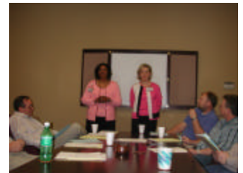
Counselors from the EAP