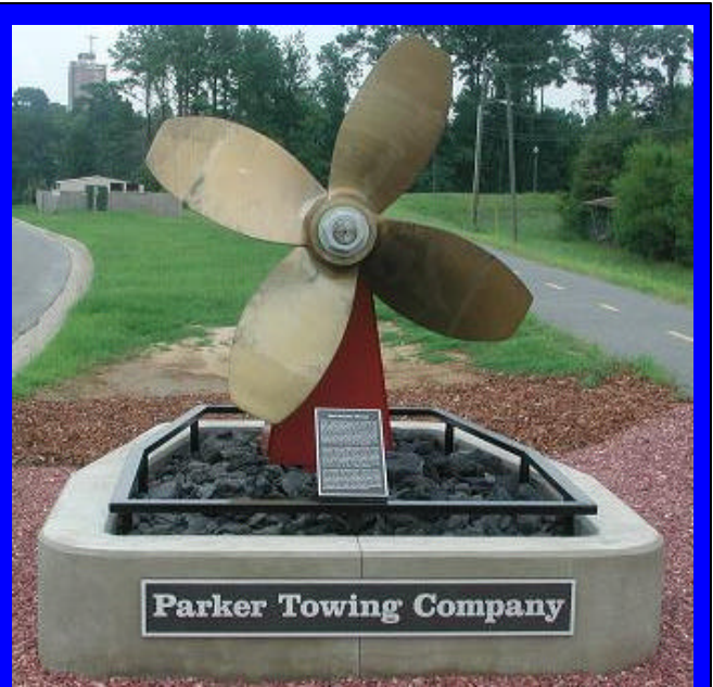
The Parker Wheel on display in front of the Parker Towing Company main office in Northport, Alabama.