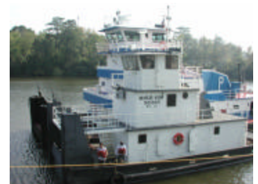
The M/V Miss Kim arrives at the Parker Towing Company dock in Northport, AL.