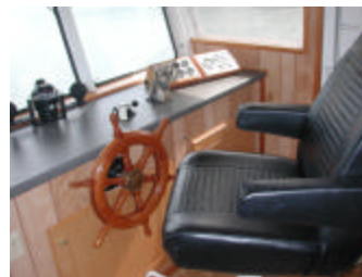
Inside the M/V Miss Kim's wheelhouse