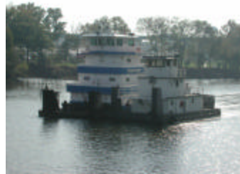
M/V Alison Haun brings the M/V Miss Kim to Northport

The M/V Miss Kim was purchased by Parker Towing Company on October 15, 2004. The motor vessel was built in 1974 and is 55 feet long by 22 feet wide. The M/V Miss Kim is powered by two Detroit 12V71 engines which account for the boat's 800 hp. The gross registered tonnage for the vessel is